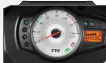
MULTI-FUNCTIONAL DIGITAL CONSOLE