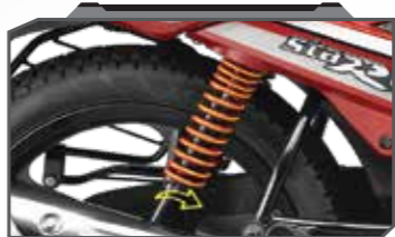
5-STEP ADJUSTABLE SHOCK ABSORBERS